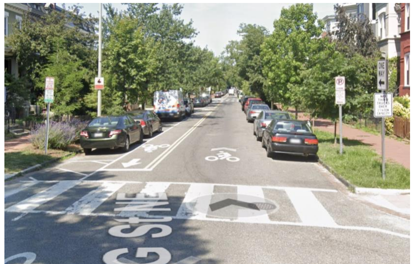
Existing contraflow bike lane in the 700 block of G St NE One-way traffic with parking on both sides

Feedback deadline is Friday, October 30, 2020 . Based on the feedback, DDOT will be issuing a Notice of Intent (NOI).